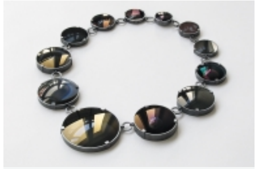
Jiro Kamata Necklace, 2007, oxidized silver, camera lens Gesellschaft für Goldschmiedekunst, D- Hanau

Open again from 21.10. after modernization work: Jewellery Collection in the Antiquity Department 15.2.–25.5.: »Die Königgräber der Skythen – Im Zeichen des Goldenen Greifen«