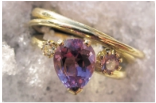
Mei Ling Knibbe »SPRING« winding ring, 18 ct yellow gold, amethyst, diamond, rose quartz, Mei Ling Sieraden, NL- Edam

Neumarkt 22 · 8001 Zürich · +41.44/2618707 Wed–Fri 12–14:00, 15–18:30:00, Sat 11–16:00 www.foc.ch