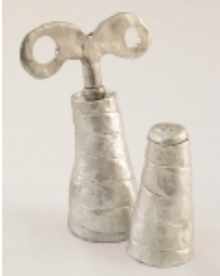
Ursula Leitner »Pepper and Salt« Silver and paint, kneaded and cast