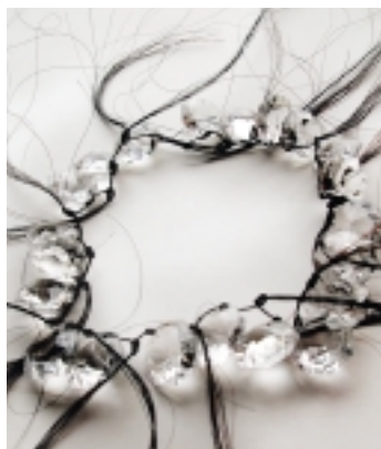
Brigitte Moser Necklace, horsehair and crystal

Allmendstrasse 5 • 6300 Zug • +41.41/7117880 Tue–Fri 10–12 h, 14–18 h; Sat 10–12 h schmu_ku_ku@bluewin.ch